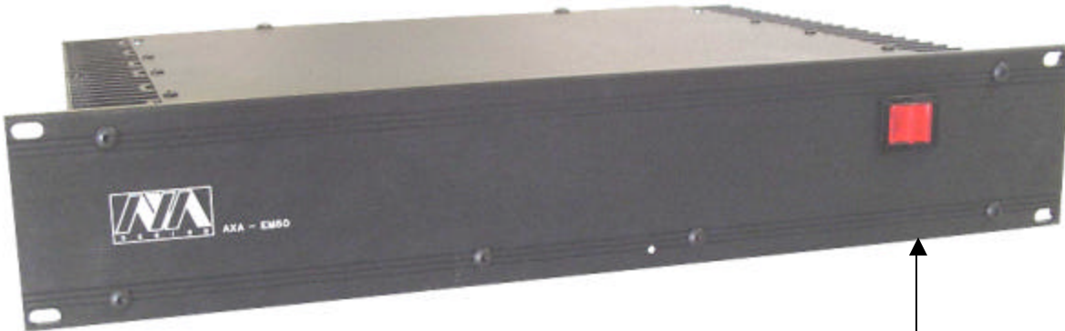
Master Power Switch